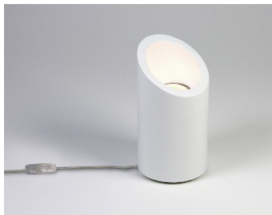
CODE: 1218001 FINISH: PLASTER

TO MAINTAIN THIS PRODUCT TO ITS BEST CONDITION, PLEASE VIEW OUR CARE AND CLEANING GUIDE ON THE SUPPORT SECTION OF THE ASTRO WEBSITE.