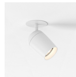
CODE: 1478011 FINISH: MATT WHITE

To maintain this product to its best condition, please view our care and cleaning guide on the support section of the astro website.