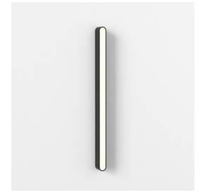
CODE: 1440006 FINISH: MATT BLACK

To maintain this product to its best condition, please view our care and cleaning guide on the support section of the astro website.