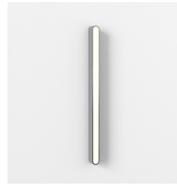
CODE: 1440002 FINISH: POLISHED CHROME