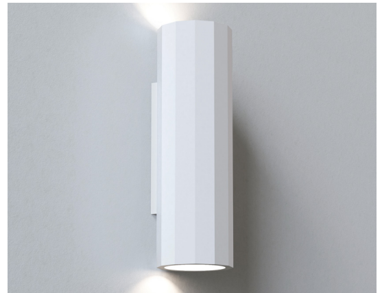
CODE: 1414002 FINISH: PLASTER

To maintain this product to its best condition, please view our care and cleaning guide on the support section of the astro website.